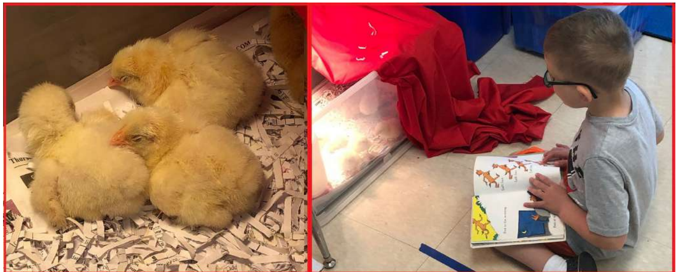
Oscar Thone is reading to the baby chicks during his free time.

Once they hatch, they are put in a separate container with a heat lamp. She says, "At first the kids get very excited around the chicks, but once they see the chicks' reaction the students calm down." The babies cower away from loud noises and big movements. Students are only allowed to pet them with two fingers, but there is plenty of interaction like the peeps coming from the yellow balls of fluff. After about five days the chicks are more active and feathers are starting to grow on their wings. It's time for classroom embryology project to come to an end the chicks to get back to the farm.