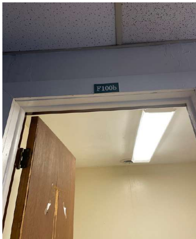
527-5 - AG Building - Room F100b