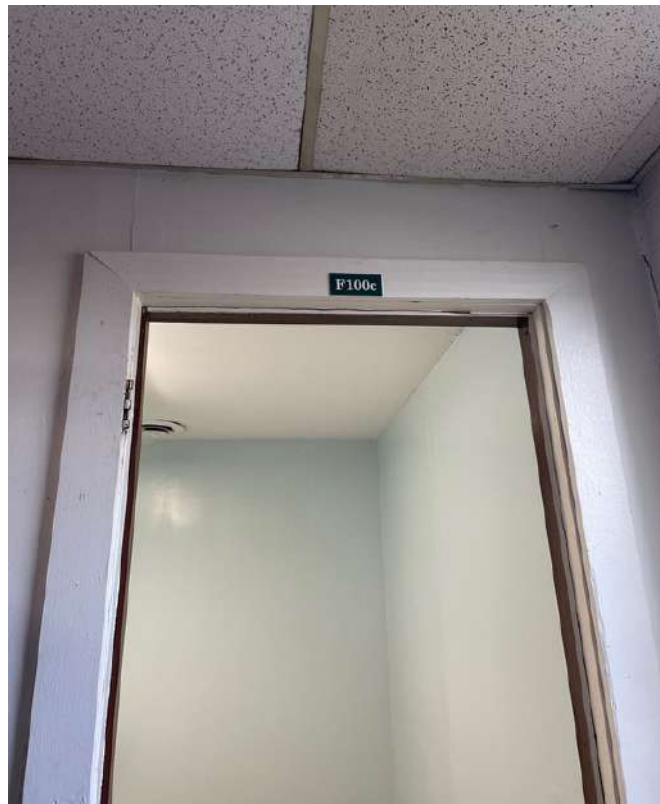
527-4 - AG Building - Room F100c