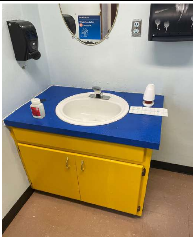
527-4 - AG Building - Room F100c