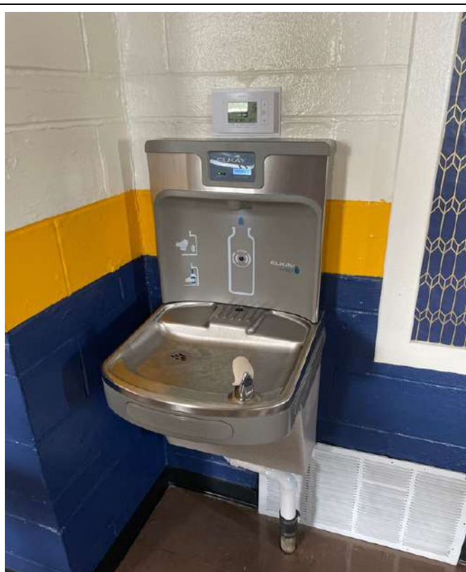
527-2 - AG Building - North Wall of Classroom