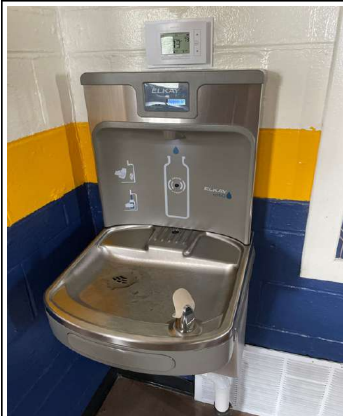
527-3 - AG Building - North Wall of Classroom