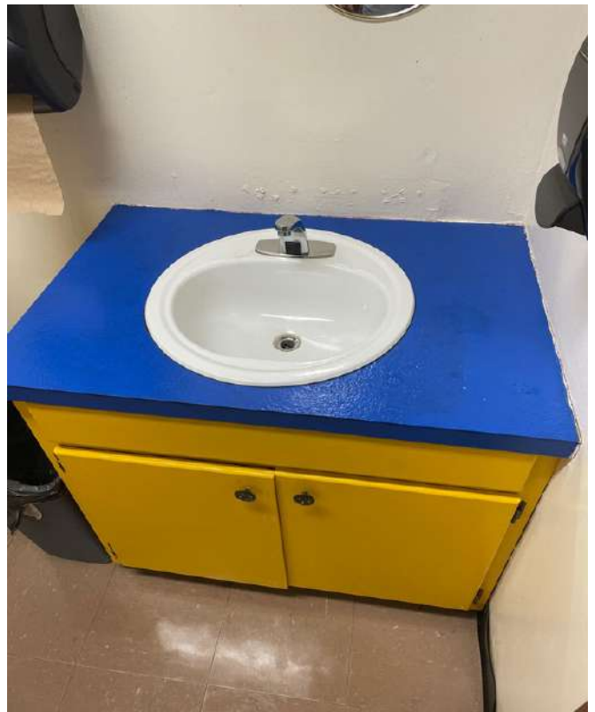
527-5 - AG Building - Room F100b