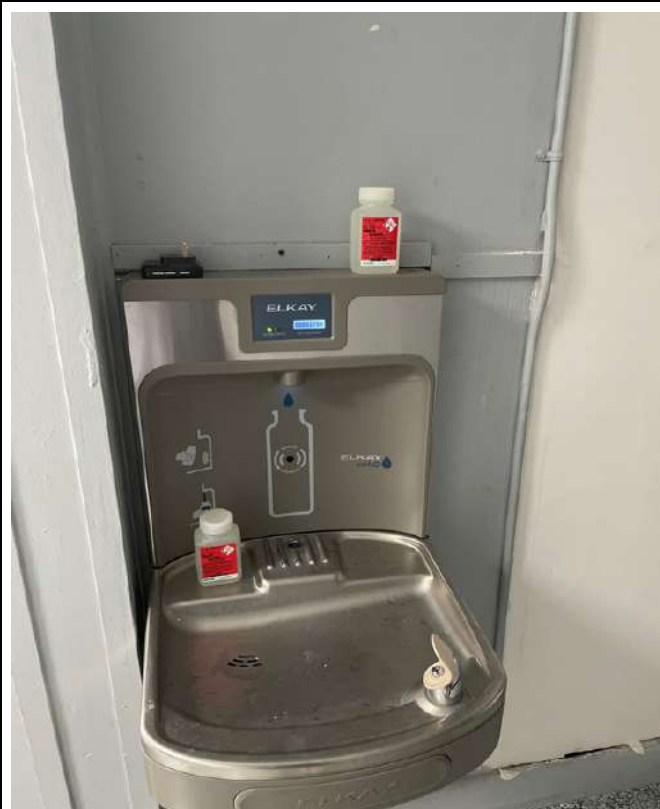
527-2 - 5th/6th Grade - Main Hallway