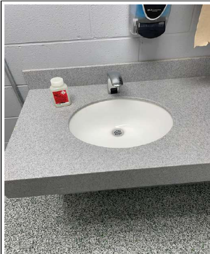
527-5 - 5th/6th Grade - Men's Restroom Left