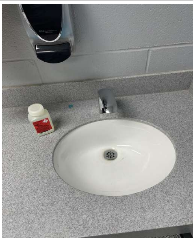
527-6 - 5th/6th Grade - Men's Restroom Right