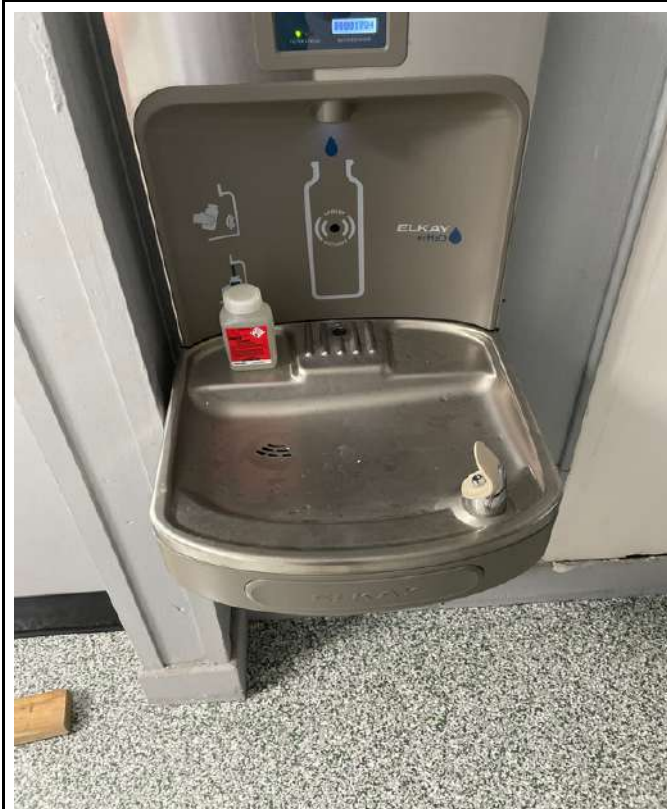
527-1 - 5th/6th Grade - Main Hallway