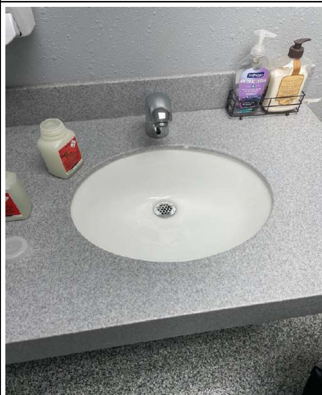
527-4 - 5th/6th Grade - Women's Restroom Right