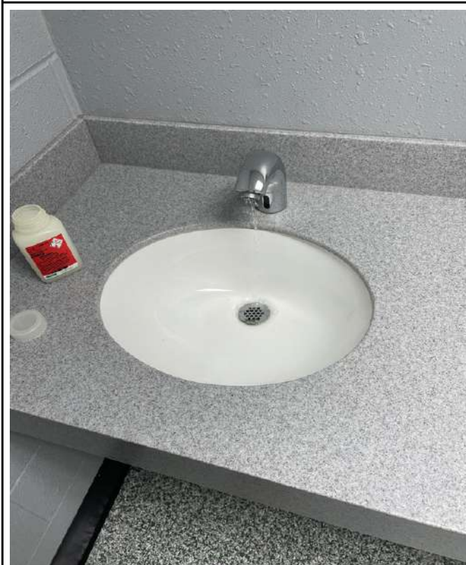
527-3 - 5th/6th Grade - Women's Restroom Left