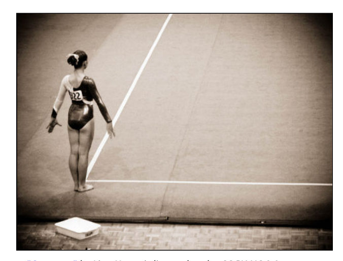
"Gymnast"