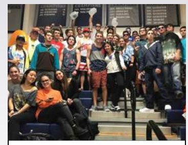
The Hawk Nest provided great support throughout the winter season. Proving once again that we have the best fans in Nassau County