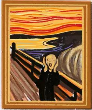
Expressionism & Fauvism