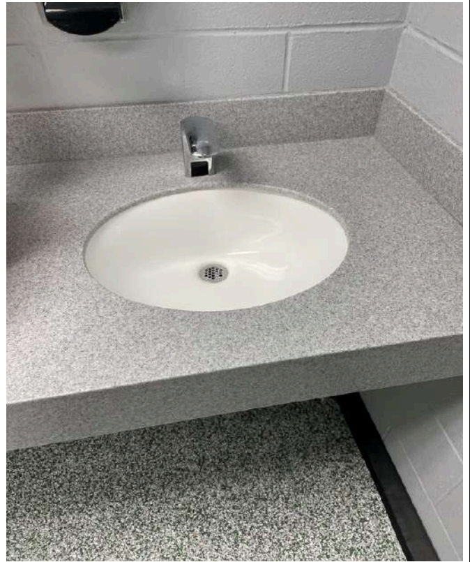
5/8/2024 - 527-6 - 5th/6th Grade - Men's Restroom Right