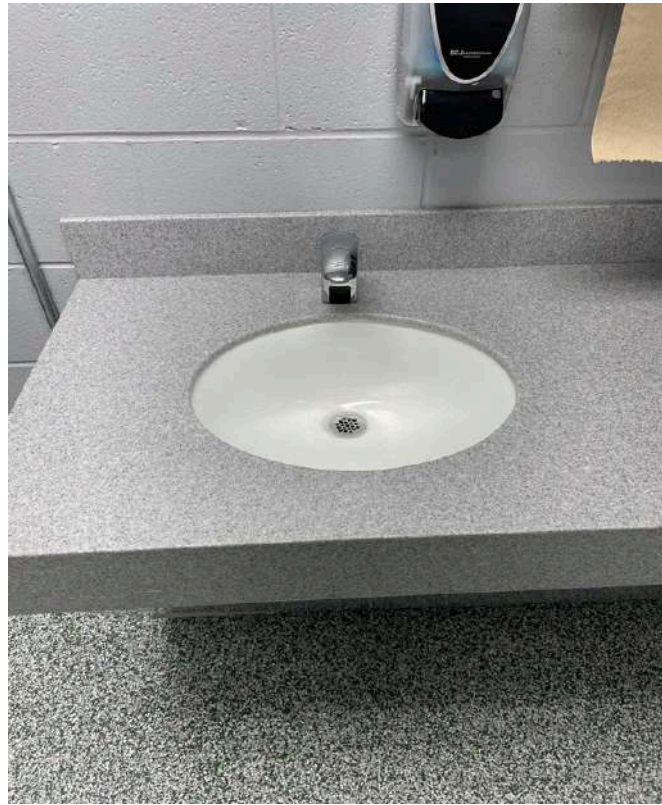
5/8/2024 - 527-5 - 5th/6th Grade - Men's Restroom Left