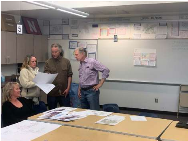
(arkitek and HMK review drawings with a Middle School teacher)