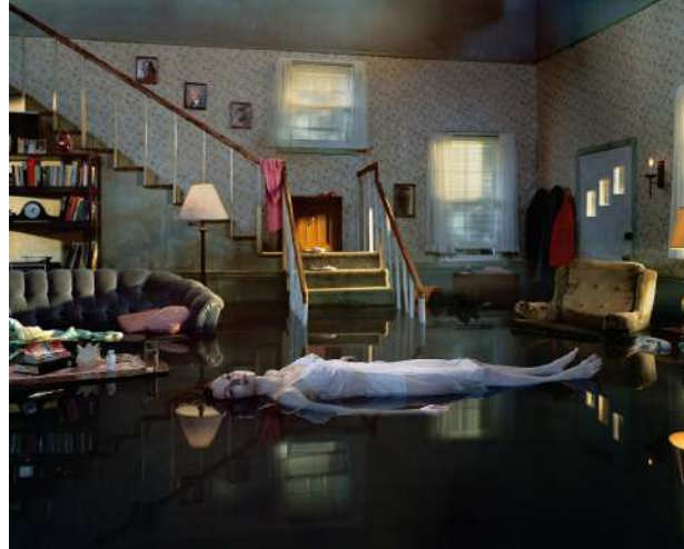
Gregory Crewdson, Untitled (Ophelia) , 2001