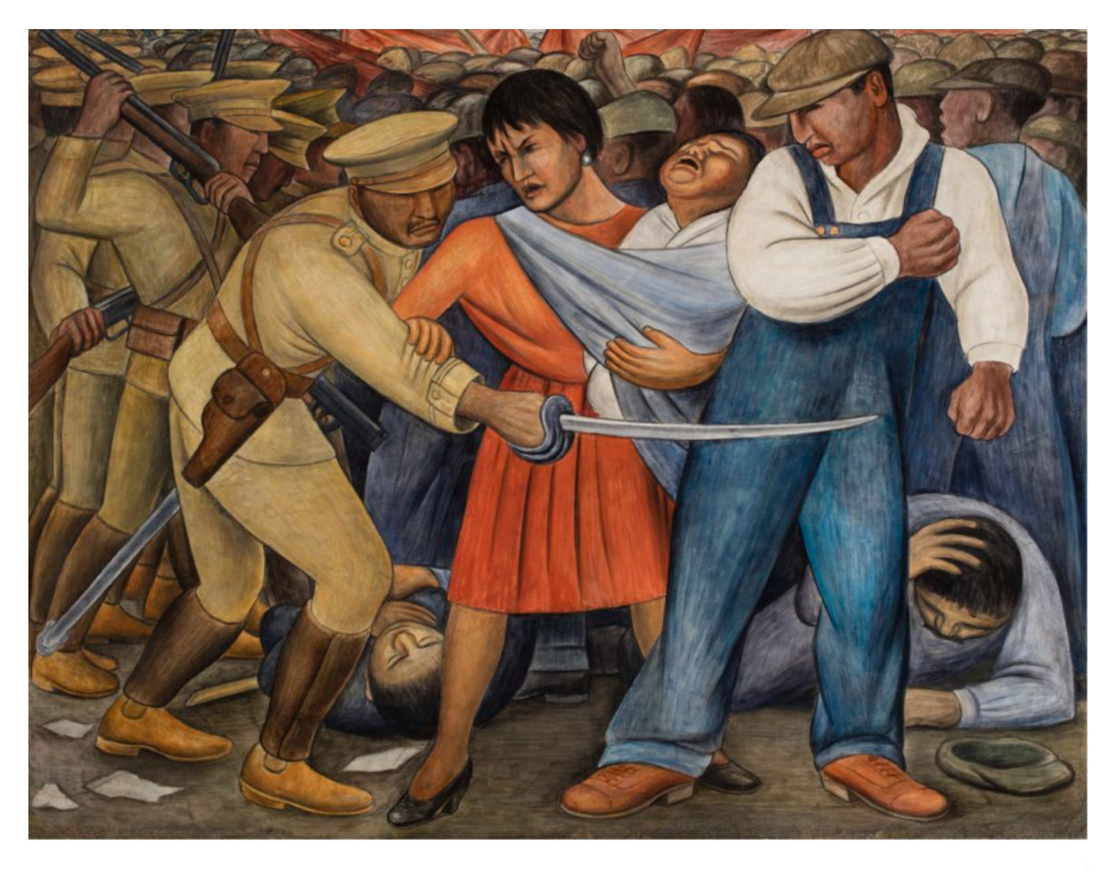
Diego Rivera, The Uprising (1931). © 2019 Banco de México-Rivera-Kahlo/ARS. Reproduction authorized by the National Institute of Fine Arts and Literature (INBAL), 2019.