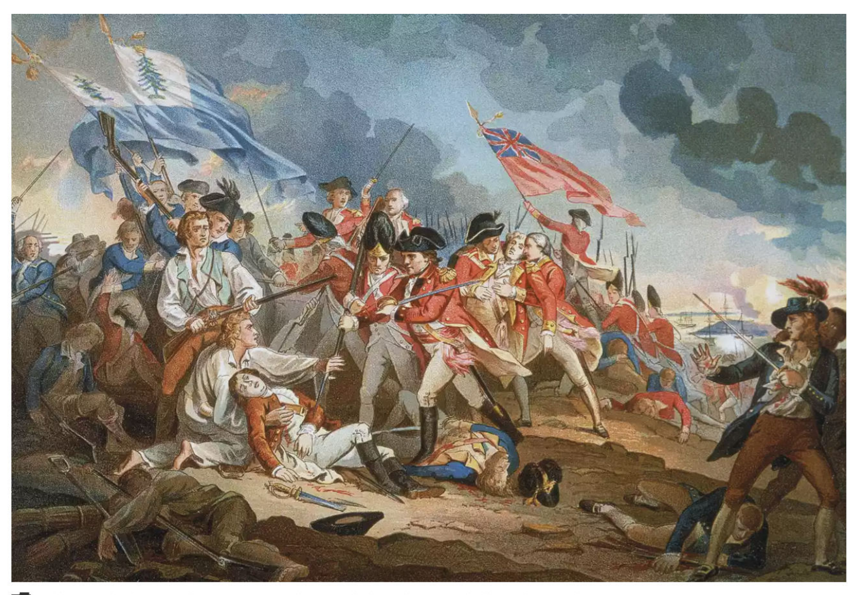
The Death of General Warren at Bunker's Hill" by John Trumbull.