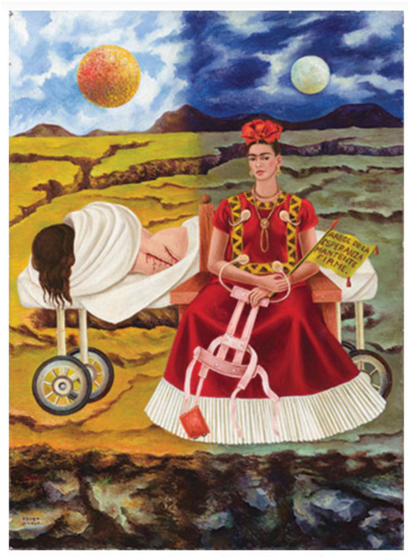
Arbol de la Esperanza (Tree of Hope), 1946, in "Unbound: Contemporary Art after Frida Kahlo" at the Museum of Contemporary Art in Chicago.