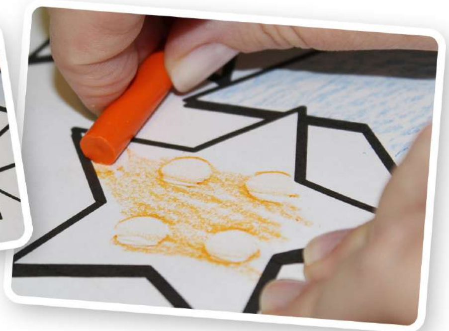
kitchen spatula with holes