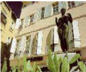
Harmonious bronze Venus (1918-28) graces square in Perpignan

Like almost all of Maillol's sculptural work, they are female nudes, none of which would make it in Vogue, although they are quite at home in the galleries of the world's major museums. There are people enough, critics and other authorities, who now and then have criticized Maillol for continuing to explore the possibilities of one subject, the feminine form. That's like saying an apple by Cezanne is just another piece of fruit.