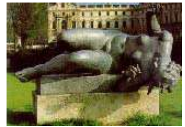
Carved in stone, Grief (1921-23) honors war dead of Ceret. The River (1938-43) seeks repose in the Tuileries.

In 1902, Vollard gave Maillol his first one-man show. One of the sculptor's entrancing little figures, Leda , caught the eye of Octave Mirbeau, who eventually bought it. Mirbeau showed Leda to Rodin, who was widely regarded as the great sculptor of the era, a towering figure in the life of France. Rodin--whose work, in direct contrast to Maillol's, concentrated on leashed energy and dynamic contortions--was greatly impressed with the purity and "luminousness" of Maillol's technique."