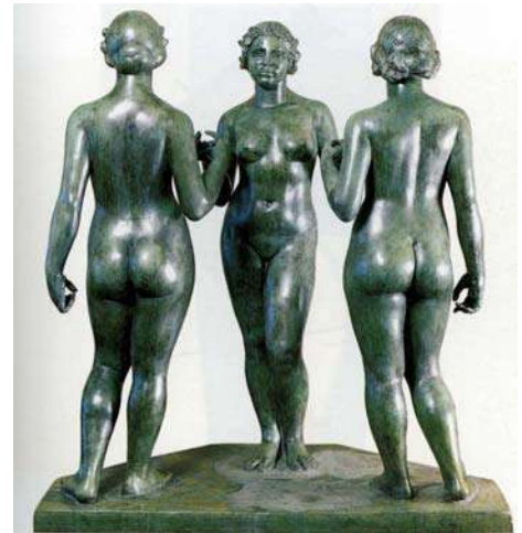
The Three Nymphs

The River is massive, a figure on her side, her head lunging downward, limbs askew; it seems miraculous that, somehow, it appears to float. With all of its drama of size and gesticulation of arms and limbs, the figure is in balance. The relationships of arms, legs, head, feet and shoulders with each other and with the torso, all contained within a defined space, express Maillol's calm and harmonious view of the world. The body becomes a way of finding balance in the world. "One forgets," said Rodin after studying a Maillol sculpture, "that the human body is an architecture, a living architecture."