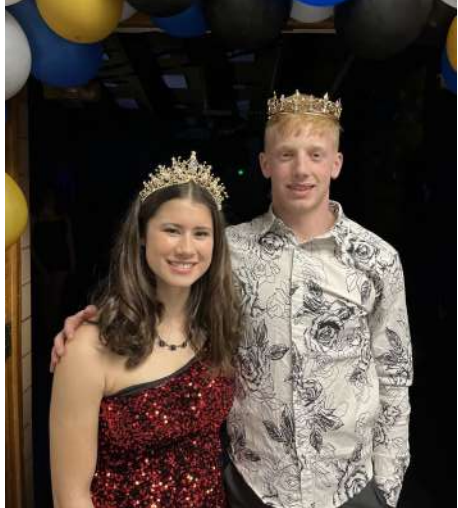
Queen Aly & King Shea