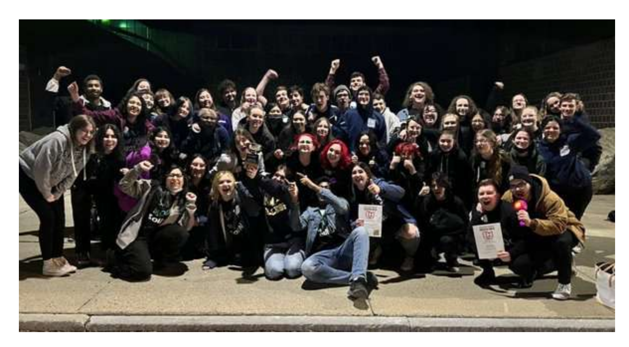
The Stage One Drama Club racked up the regional honors for its production of "Small Mouth Sounds" at the state High School Drama Festival.