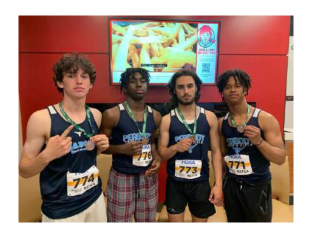
PEABODY TRACK & FIELD