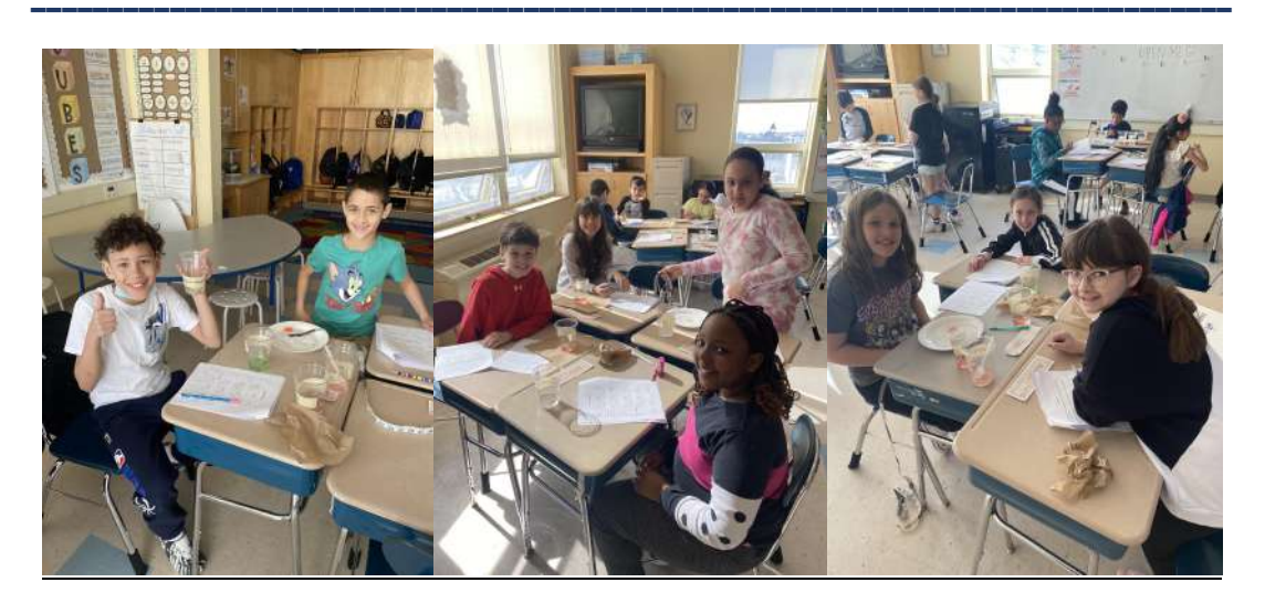
CARROLL SCHOOL GUMMY BEAR EXPERIMENT

In preparation for the upcoming Science Fair, all students in 4th grade completed the Gummy Bear Experiment, following the Scientific Method.