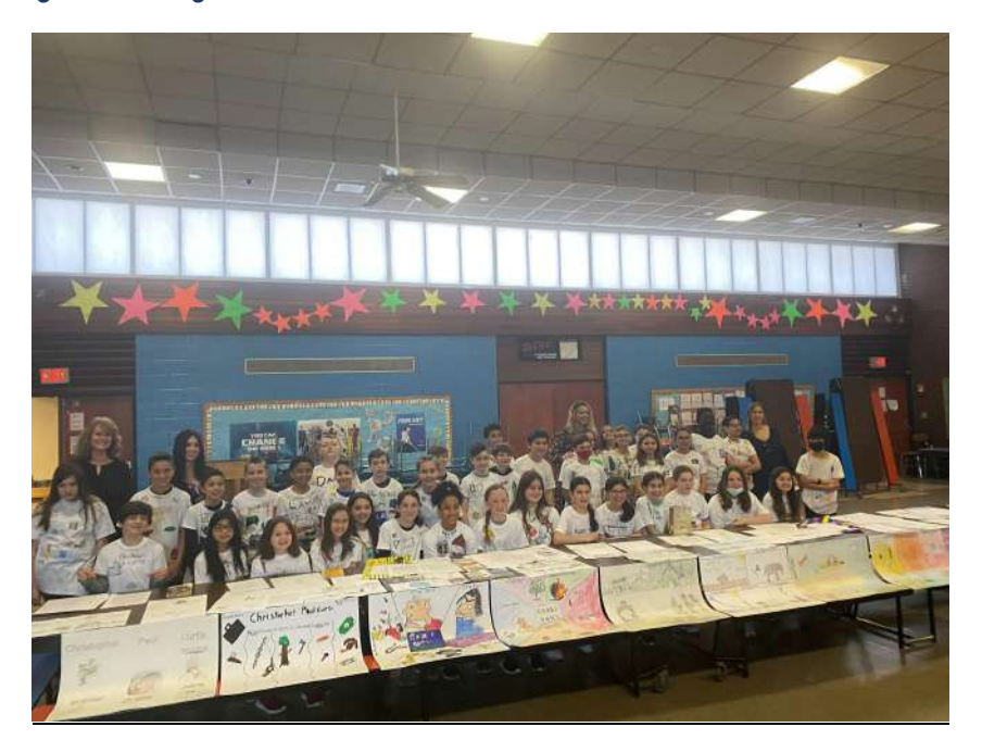
BURKE SCHOOL ANIMAL HABITATS & REPORTS

Several Burke School 1st grade students presented their animal reports to the entire school during our community assembly. They also displayed their habitat dioramas for the school to take a walking tour through as well.