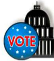
Government & Public Administration