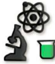
Science, Technology, Engineering & Math