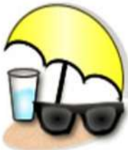
Hospitality & Tourism