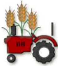
Agriculture, Food & Natural Resources