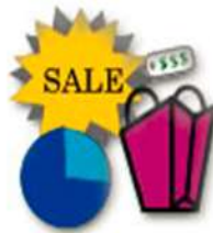
Marketing, Sales & Service