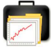
Business, Management & Administration