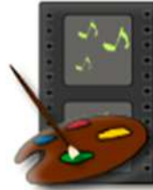
Arts, Audio/Video Technology & Communications