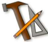
Architecture & Construction