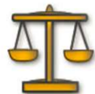
Law, Public Safety, Corrections & Security