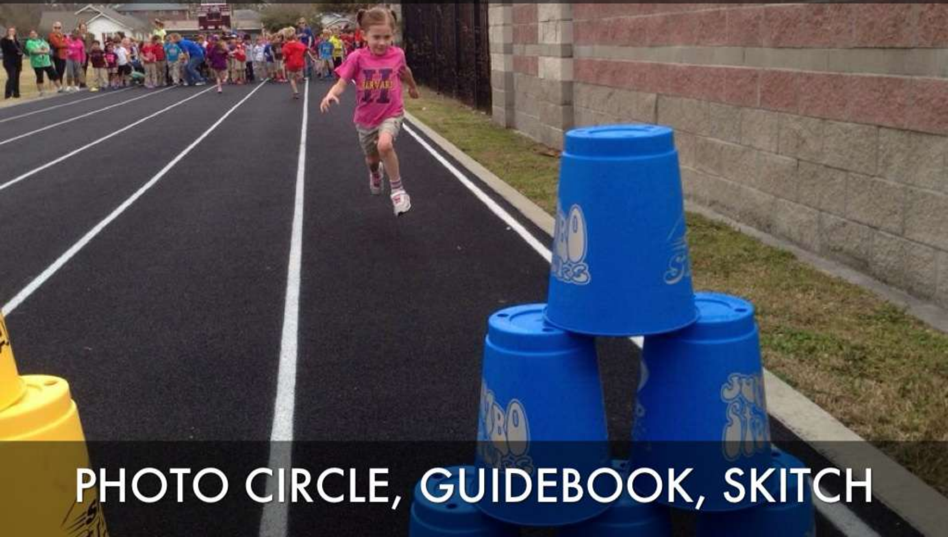
PHOTO CIRCLE, GUIDEBOOK, SKITCH