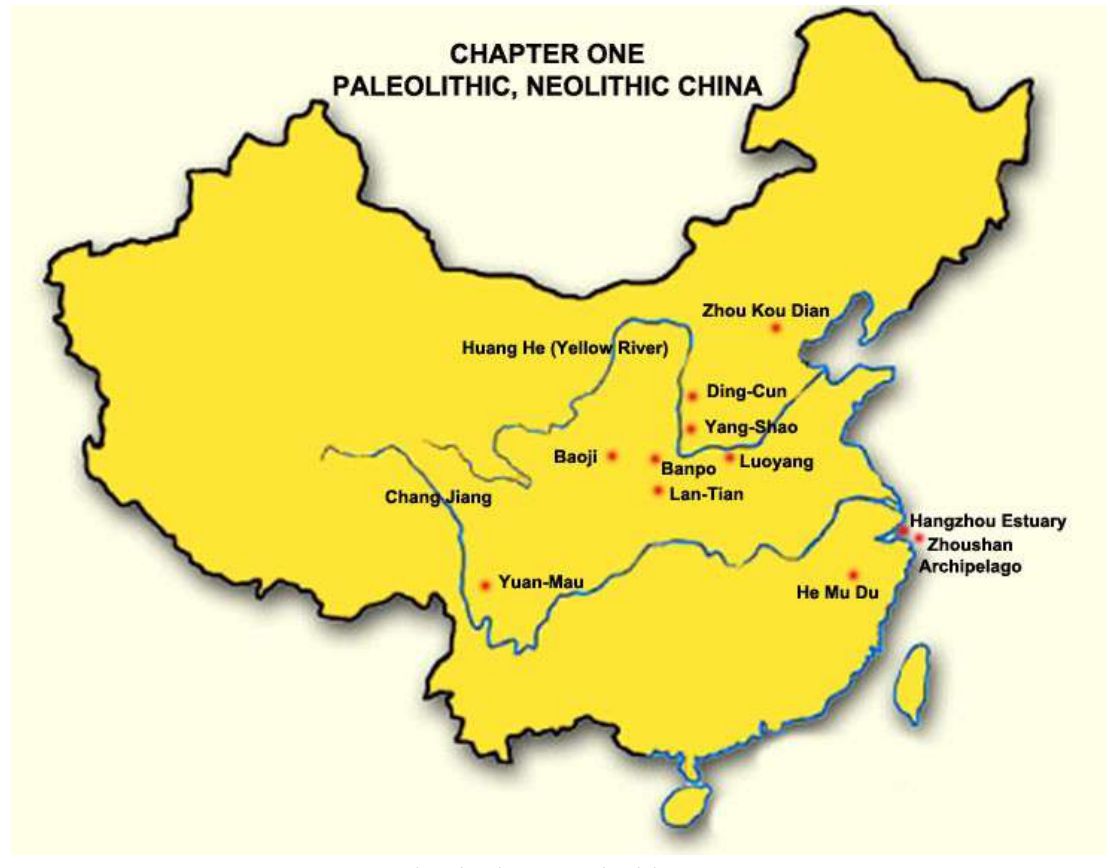
Physical Map of China