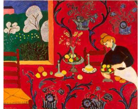
Henri Matisse, The Red Room , 1908

Art: 29-2, 29-7, 29-11, 29-12, 29-24, 29-35, 29-48, and 29-76.