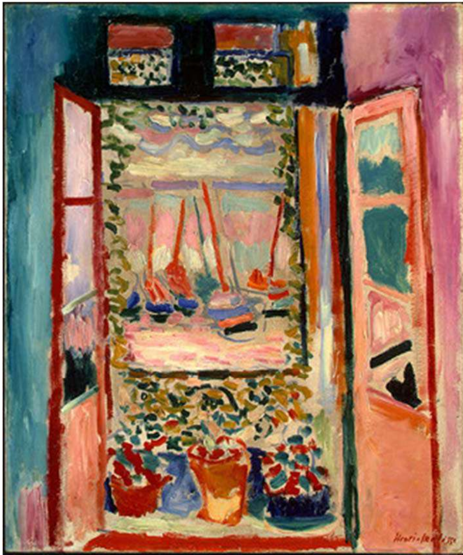
Henri Matisse, The Open Window , 1905