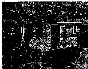
El Sol Asombra, 1999. Rafael Ferrer. Oil on canvas, 60 x 72 in. Butler Institute of American Art, Youngstown, OH.