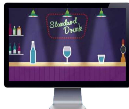
Learning the Meaning of a Standard Drink