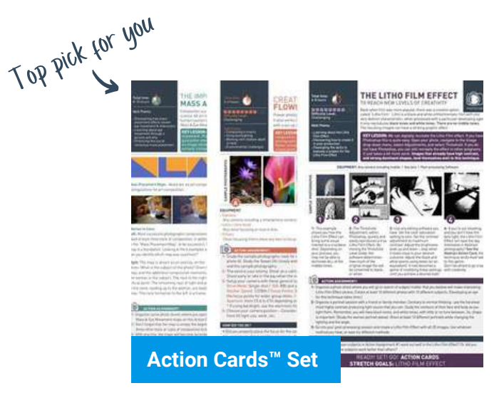
65 beautifully designed & printable project sheets that will give you over 200 photography assignments.

DON'T MISS OUT: Limited Time Daily Free Bonuses Expire 11:59pm EST!