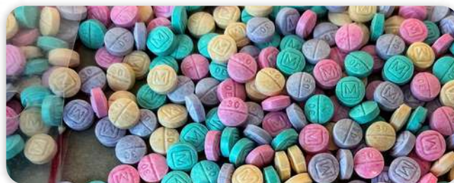
*FAKE rainbow oxycodone M30 tablets containing fentanyl