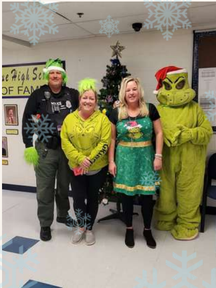
Grinches spotted at CHS!

In December, Chincoteague High School, in conjunction with the Key Club, Senior Beta and FBLA, hosted a nonperishable food drive for the local Food Bank. Many thanks to those who donated.