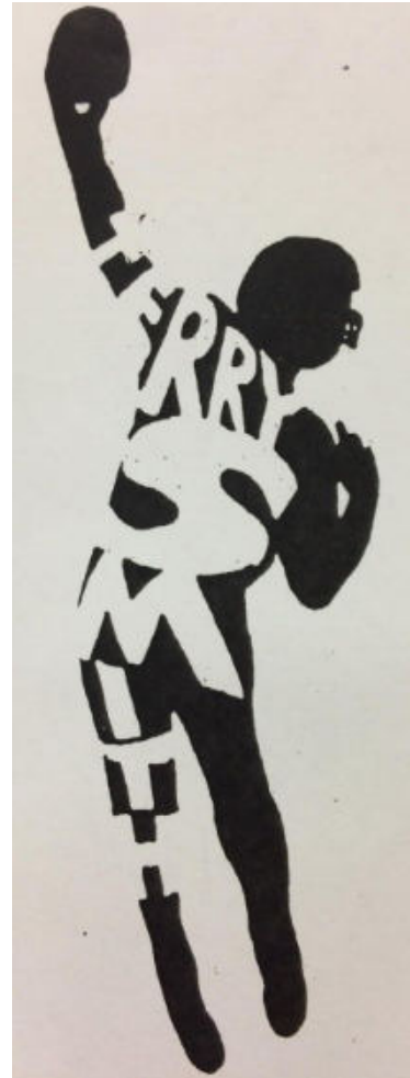
Student Example