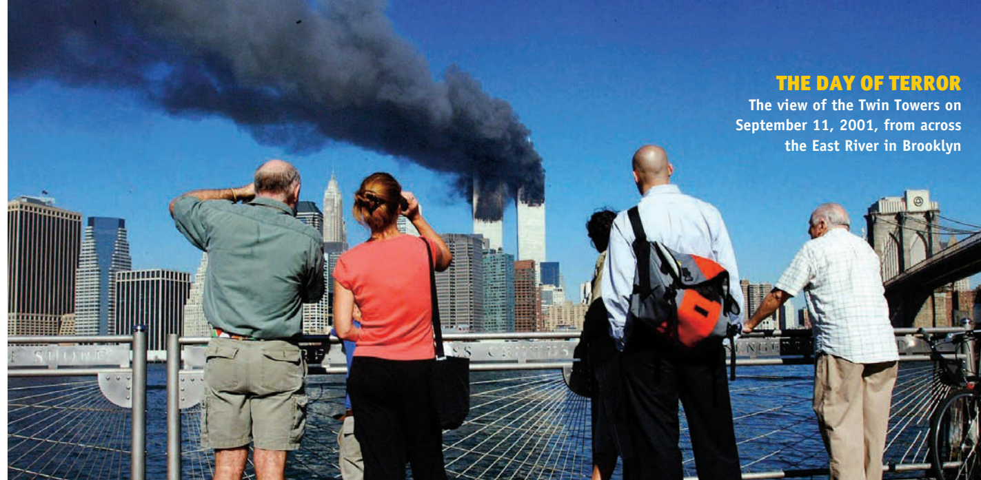
THE DAY OF TERROR The view of the Twin Towers on September 11, 2001, from across the East River in Brooklyn

for a moment. When he returned, he told the class that someone had bombed the World Trade Center. Students were to gather their things and head to the lunchroom. Rumors flew. The bomb squad appeared. Someone said a second plane had been crashed into the South Tower. The principal announced that the school was to be evacuated in 5 minutes.