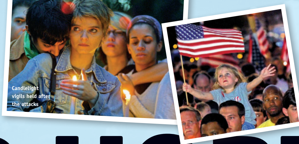
Candlelight vigils held after the attacks