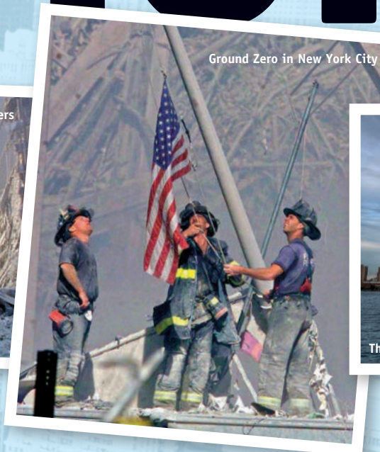
Ground Zero in New York City