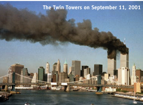
The Twin Towers on September 11, 2001