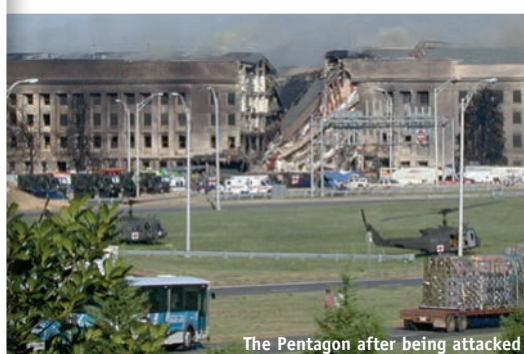
The Pentagon after being attacked