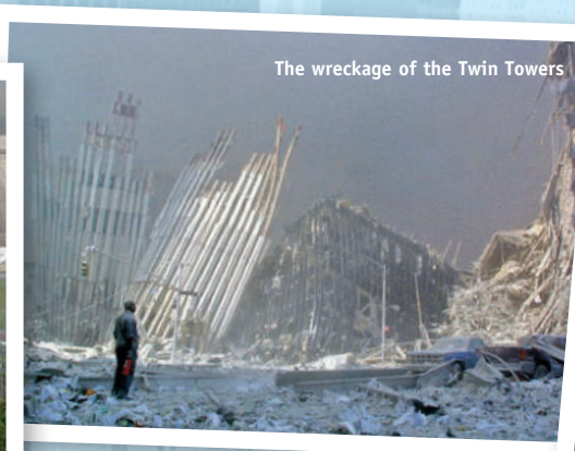
The wreckage of the Twin Towers