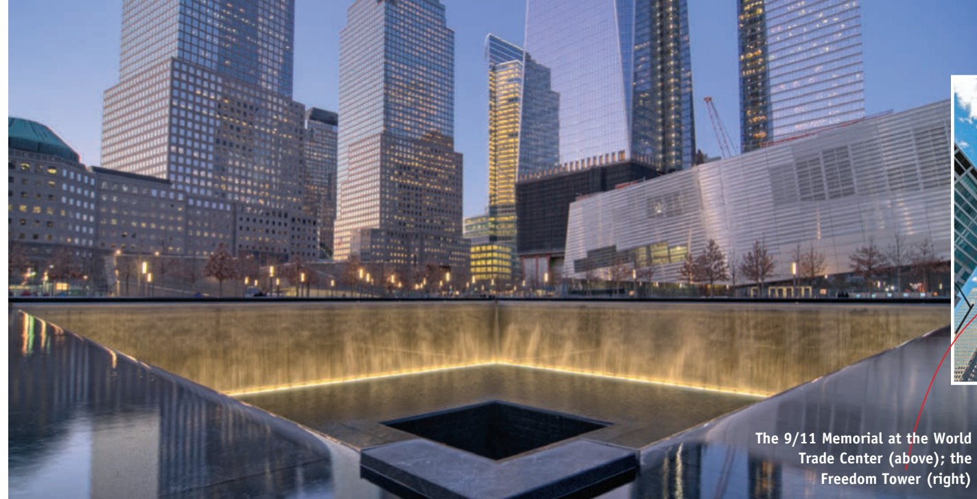
The 9/11 Memorial at the World Trade Center (above); the Freedom Tower (right)