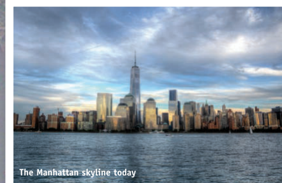
The Manhattan skyline today

One girl's incredible story of survival and healing in the wake of September 11