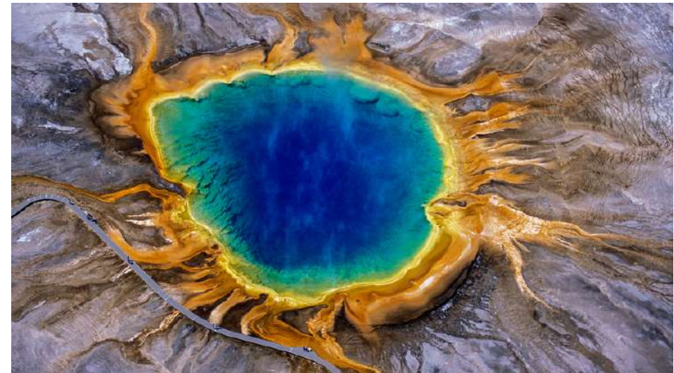
Grand Prismatic Spring is one of the largest and most beautiful examples of a common hydrothermal feature in Yellowstone National Park.

A supervolcano underneath Yellowstone National Park might one day erupt again. If it does, it could happen with far less warning time than previously thought.