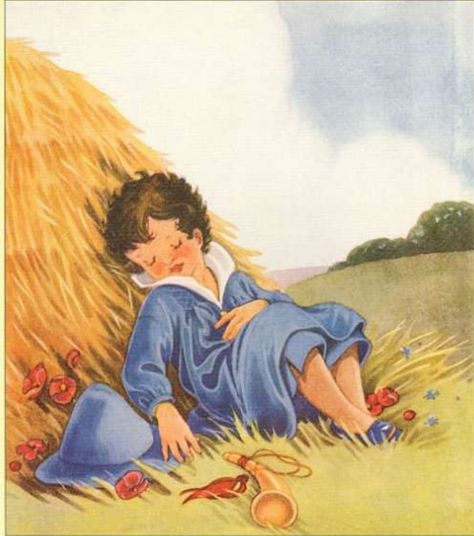
Little Boy Blue, come, blow your horn,

I am going to read another rhyme about someone else whose job is to take care of sheep. Listen to find out whether or not this person does a good job.