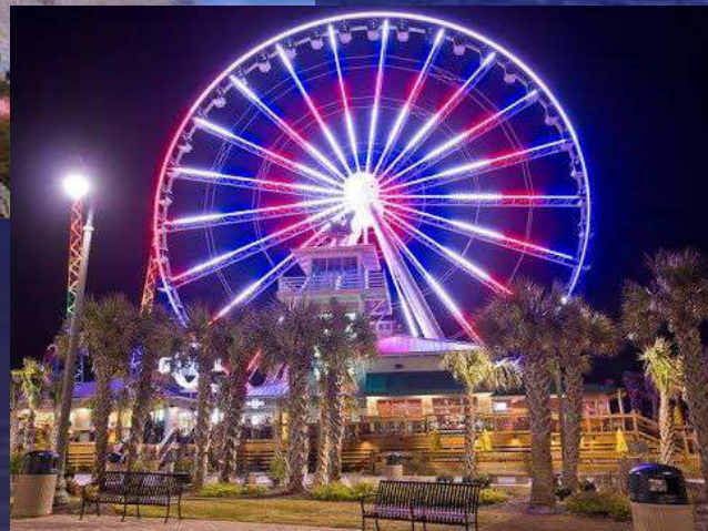
Sky Wheel Myrtle Beach