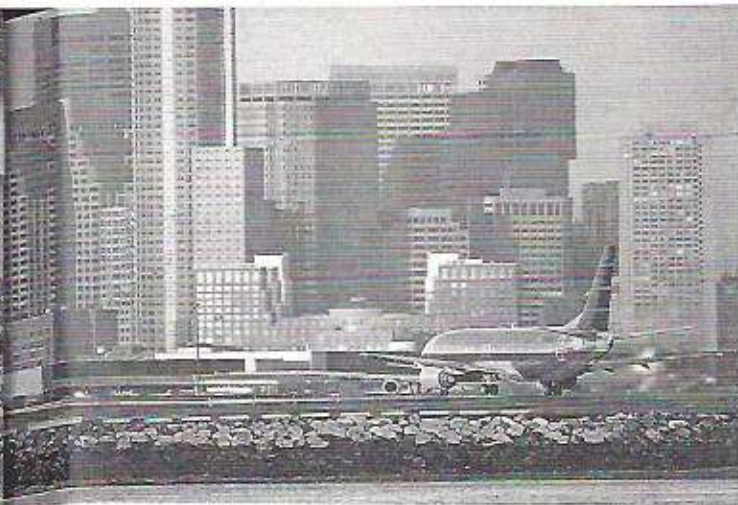
Airplanes from Boston's Logan International Airport move people and ideas around the globe.