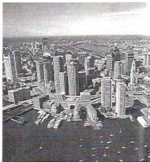
Boston is located on the shores of the Atlantic Ocean.

THINKING ABOUT GEOGRAPHY What characteristics does your city or town share with nearby cities or towns?