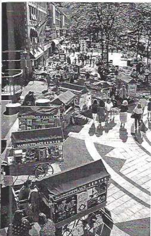
People shop, eat, and interact at Boston's famous Quincy Market.