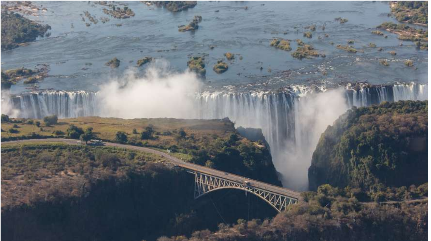
Image 1. The bridge over the Zambezi River at Victoria Falls separates the countries of Zimbabwe and Zambia.

To better understand our place in the world, we use the five themes of geography. These are location, place, human-environment interaction, movement, and region. Each is a different way of discussing or describing an area.