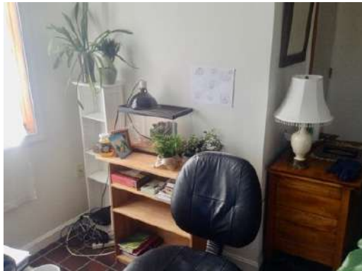
Making sure students can see the class pet (even from home) gives them a sense of familiarity.