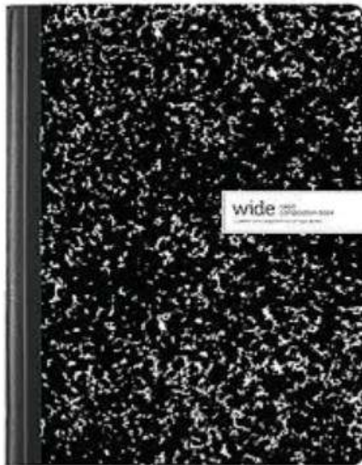
WIDE RULED COMPOSITION NOTEBOOK