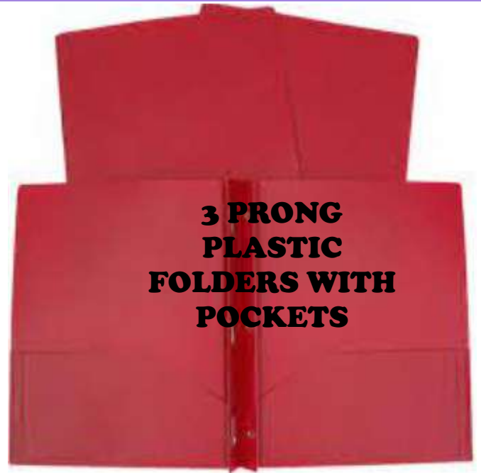
3 PRONG PLASTIC FOLDERS WITH POCKETS