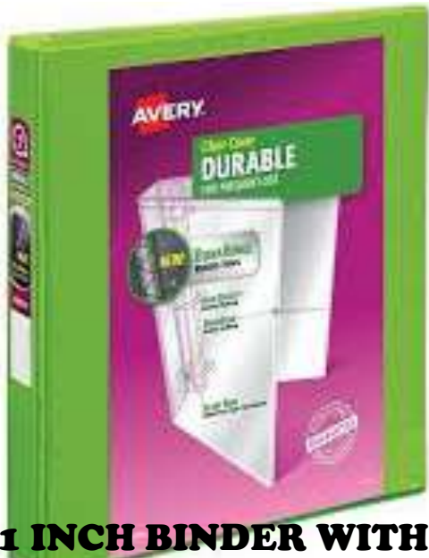
1 INCH BINDER WITH CLEAR FRONT POUCH