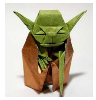
origami - folded paper

http://weburbanist. com/2008/12/02/papercraft-creative-paper-artdesign-sculpture/