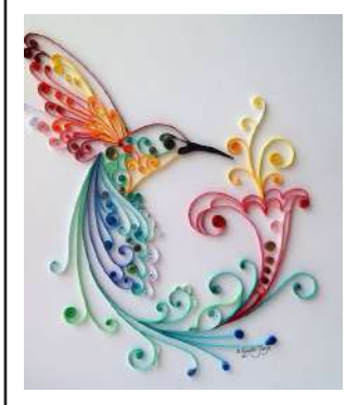
traditional quilling - curled