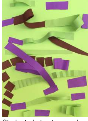
Student abstract example

Clean Up: Keep any usable scraps for future classes. Throw away small scraps. Make sure glue sticks are capped tightly.