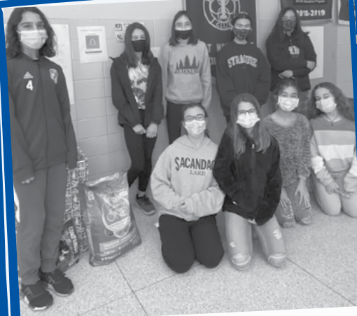
Middle schoolers supported the annual toy drive as well, collecting items to donate.