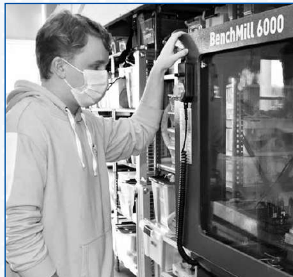
A PLTW engineering student uses a 3D mill to construct a rapid prototype.