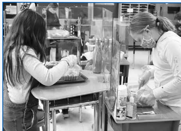
Third graders planning and carrying out a scientific investigation in the "What Happened to the Dinosaurs?" unit.