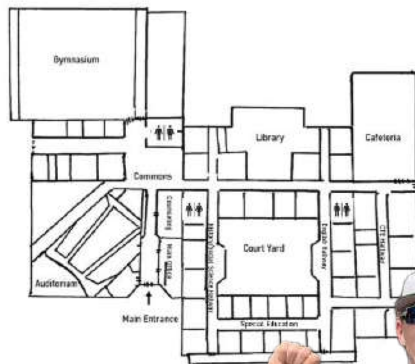
RCHS Map and locations of Departments

Gymnasium: English, Math, Science, History, Social Studies, PE, World Languages, Independent Studies, Career Education, Fine Arts, and other Electives