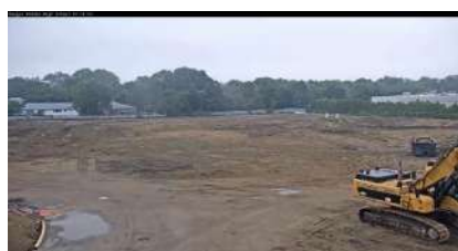
Former site of SHS - July 23, 2020