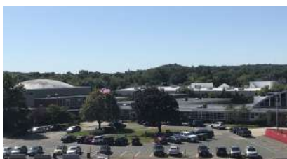
SHS- August 31, 2019