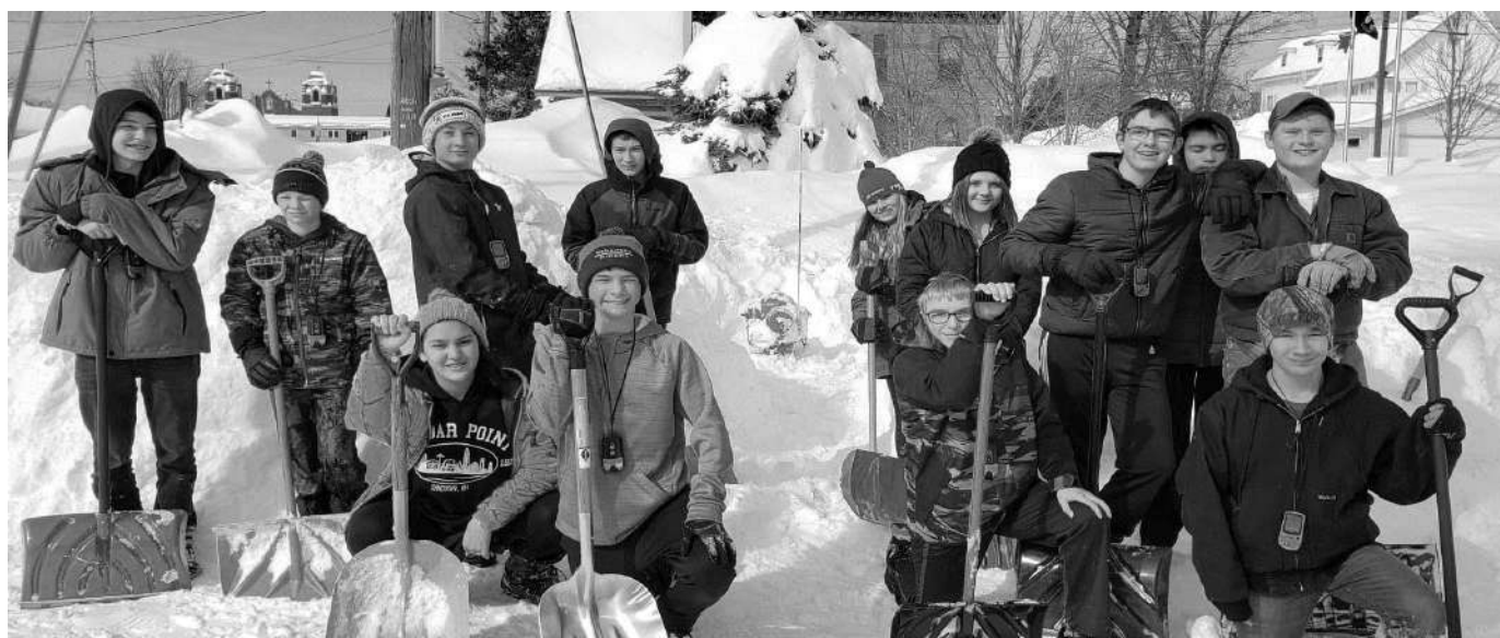
Pictured above: Students from the Negaunee Middle School Environmental Adventures Class take a break while digging out fire hydrants that were buried in the snow throughout the city of Negaunee.

This year's 8th Grade Environmental Adventures classes have been busy! Students in the EA class have practiced climbing skills on the NMS Bouldering Wall (provided through grants from The Marquette Community Foundation, mBank, and Cleveland Cliffs), helped the city of Negaunee dig out buried fire hydrants this winter, and completed the 24 Hour Wilderness Experience. Through their activities, the EA students have learned and utilized many useful life skills, as well as experiencing the importance of teamwork. The NMS Environmental Adventures classes would like to say a special thank you to those organizations listed and the Negaunee community for supporting this unique educational experience for our NMS students!