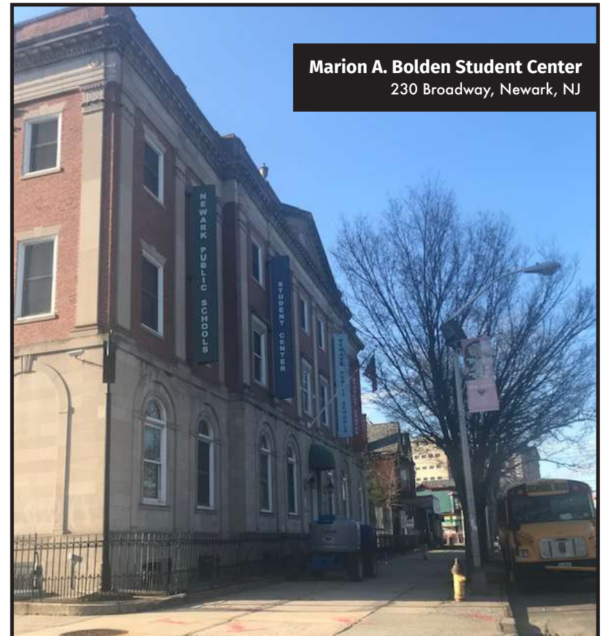
Marion A. Bolden Student Center 230 Broadway, Newark, NJ