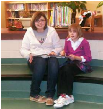
The Anderson Youth Community Council (AYCC) makes a difference in our schools by volunteering to tutor students.

Associate of Arts Business Management Construction Technology Fire Science Nursing/Nurse-aid Certification Social Work/Family Support Associate of Science Emergency Medical Tech(EMT) Office Systems Technology Early Childhood Education (IECE)