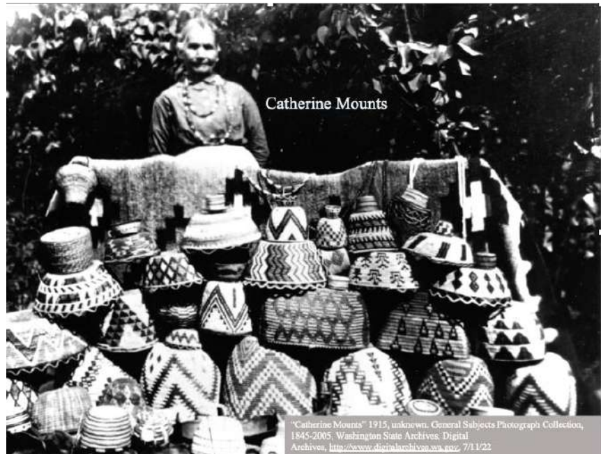
"Catherine Mounts" 1915, unknown.

Over the years, the blending of cultures between Hudson's Bay Company employees changed the lifestyle of many local Native Americans. Many Native Americans started to dress like Europeans. By the early 1850s, many Nisqually men wore trousers, button-up shirts, and boots, while many Nisqually women wore skirts and blouses. There were no significant conflicts between them. At that time, Nisqually People still fished, hunted, and gathered in traditional areas and were free to follow their beliefs and practices since time immemorial.