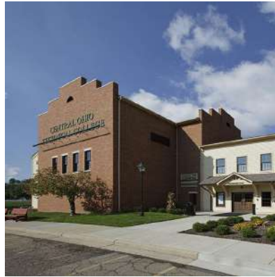
The Coshocton campus