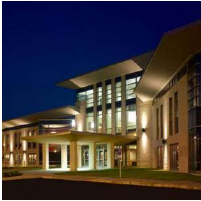
The Newark campus