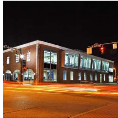
The Knox campus