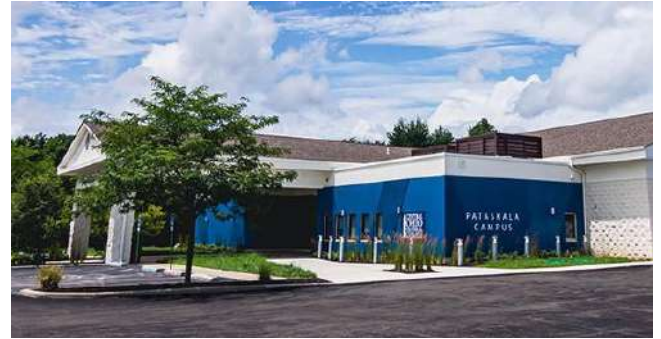
The Pataskala Campus