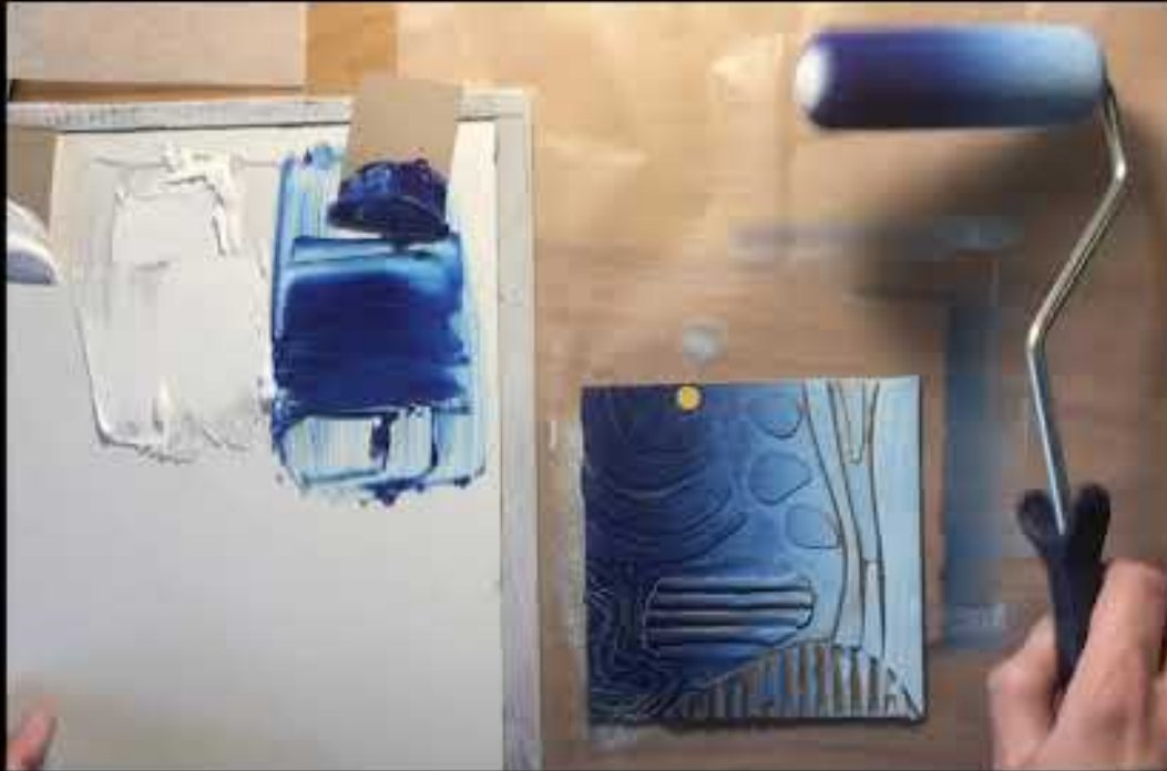
Video: Collograph Print