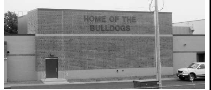
New signage for the Odessa High School, located on the west side of the building. The signage was paid for by the Odessa High School Class of 2007.