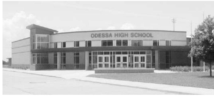
Frontage to the Odessa High School after new addition was completed in May 2007.

2007 for their generous donation of new signage located on the west side of the Odessa High School building. The signage reads "Home Of The Bulldogs" and coordinates with the signage on the front of the building. This feature is a great addition to our high school and serves as a symbol of our school pride. Thank you Odessa High School Class of 2007!