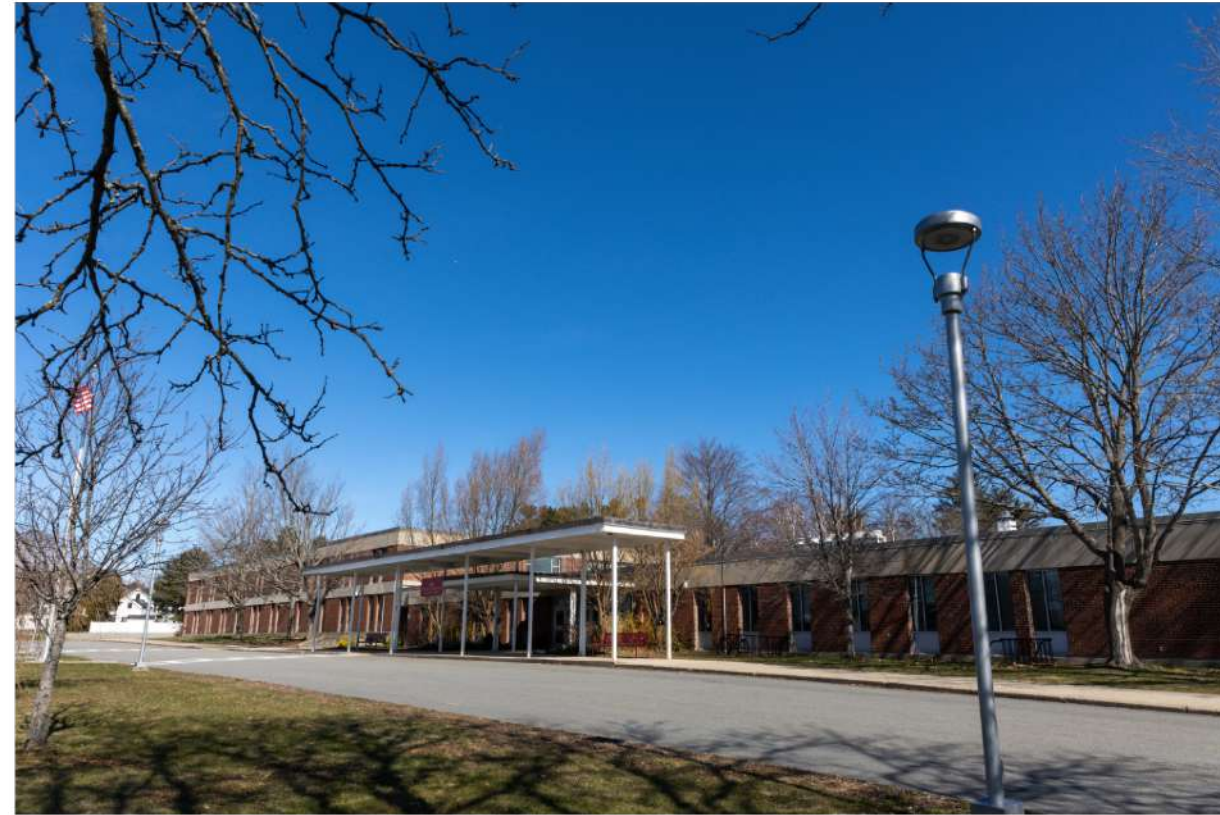
Edward G. Molin Upper Elementary Rupert A. Nock Middle