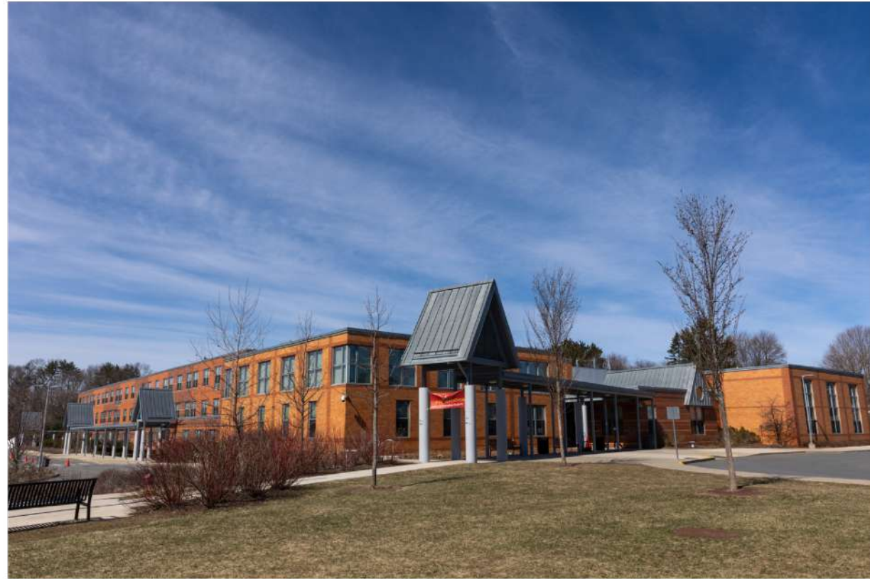
Francis T. Bresnahan Elementary