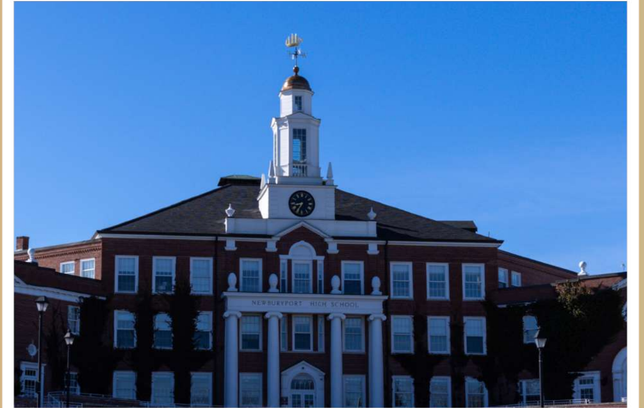
Newburyport High School