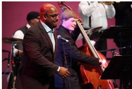
Grammy Award winning bassist Christian McBride

Many of our students choose to take summer school in order to fit in all the amazing electives New Trier offers. Read the article Summer School Succeeds on the opposite side of this sheet from New Trier's sophomore student newspaper, "The Journal" to hear the student perspective on why so many take advantage of this opportunity.