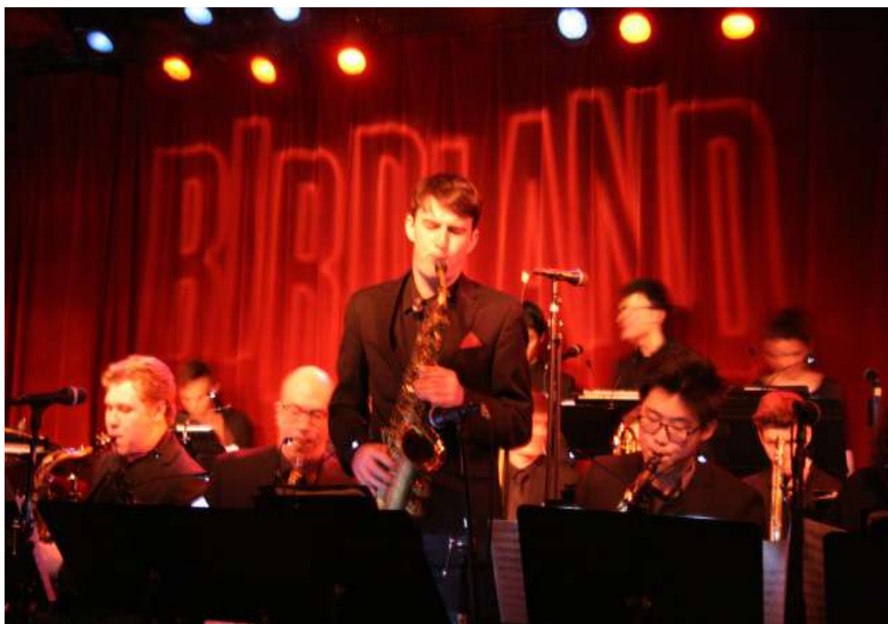
Jazz Ensemble 1 performs at Birdland in New York City during their 2017 spring break trip.