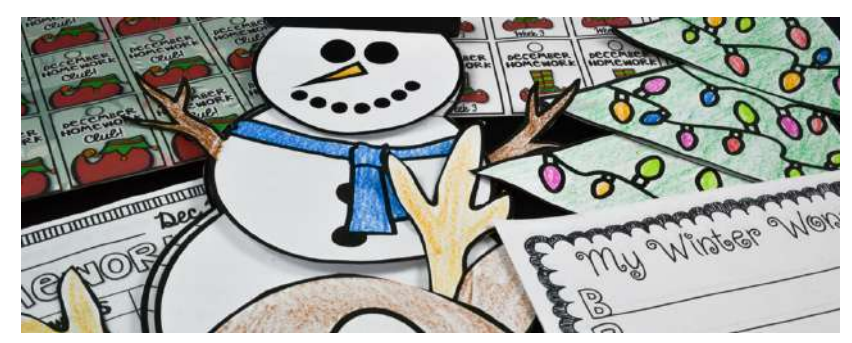
North Elementary School Weekly Memo for Parents December 9, 2019