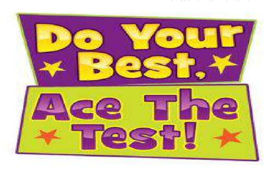
Revised B. Dechman 6/14/22