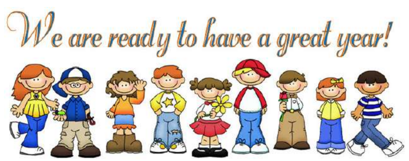
Opportunities to Be Involved

Courtesy of California Governor's Mentoring Partnership.