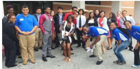
Clayton State University Student Ambassadors with WBL students before a guided tour of the campus.

The Work-Based Learning (WBL) Success Seminar is held annually and was hosted for the second consecutive year by Clayton State University. 200 students and school representatives attended from ten Clayton County high schools. The seminar provided students an opportunity to gain real world, real work experience. The Success Seminar included a general session and eight different workshops facilitated by industry professionals. Workshops focused on teaching soft skills to students to be successful in the workforce, as well as introduce career options. The afternoon concluded with Clayton State University student ambassadors taking Clayton County Public Schools WBL students on a brief campus tour including classrooms, student housing, student center and the athletic center.