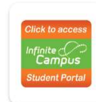
Campus Student Portal