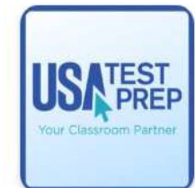
USA Test Prep