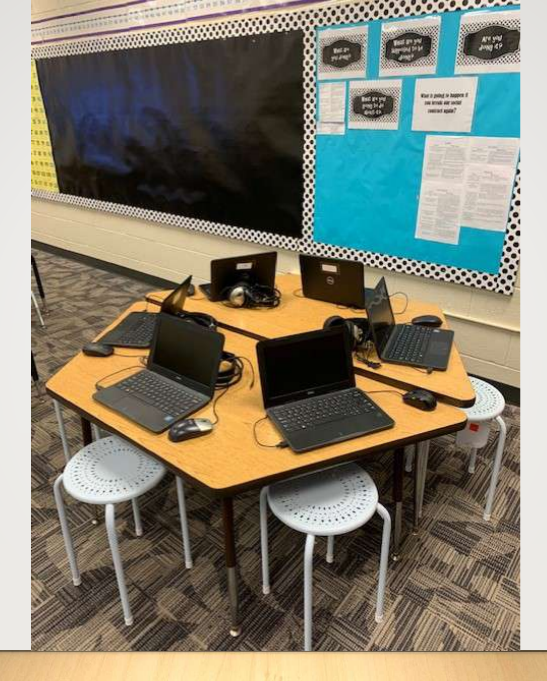
This is our table where we will eventually work in small groups.