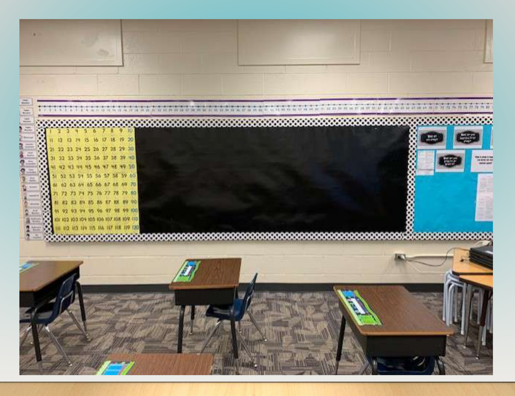
Here is one side of our room where we will keep our social contact and use math resources.