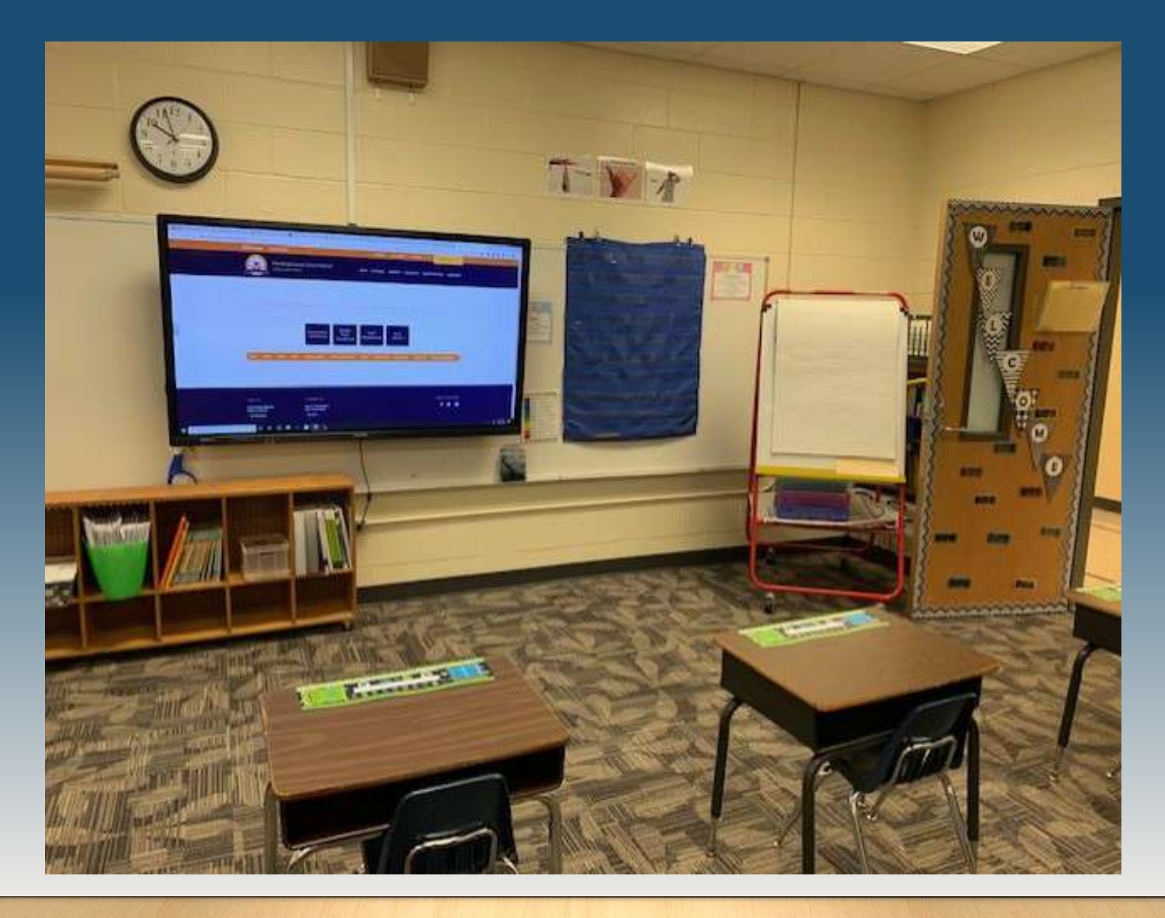
This is the front of our room where we will use the Recordex Board, do word sorts, and make charts.