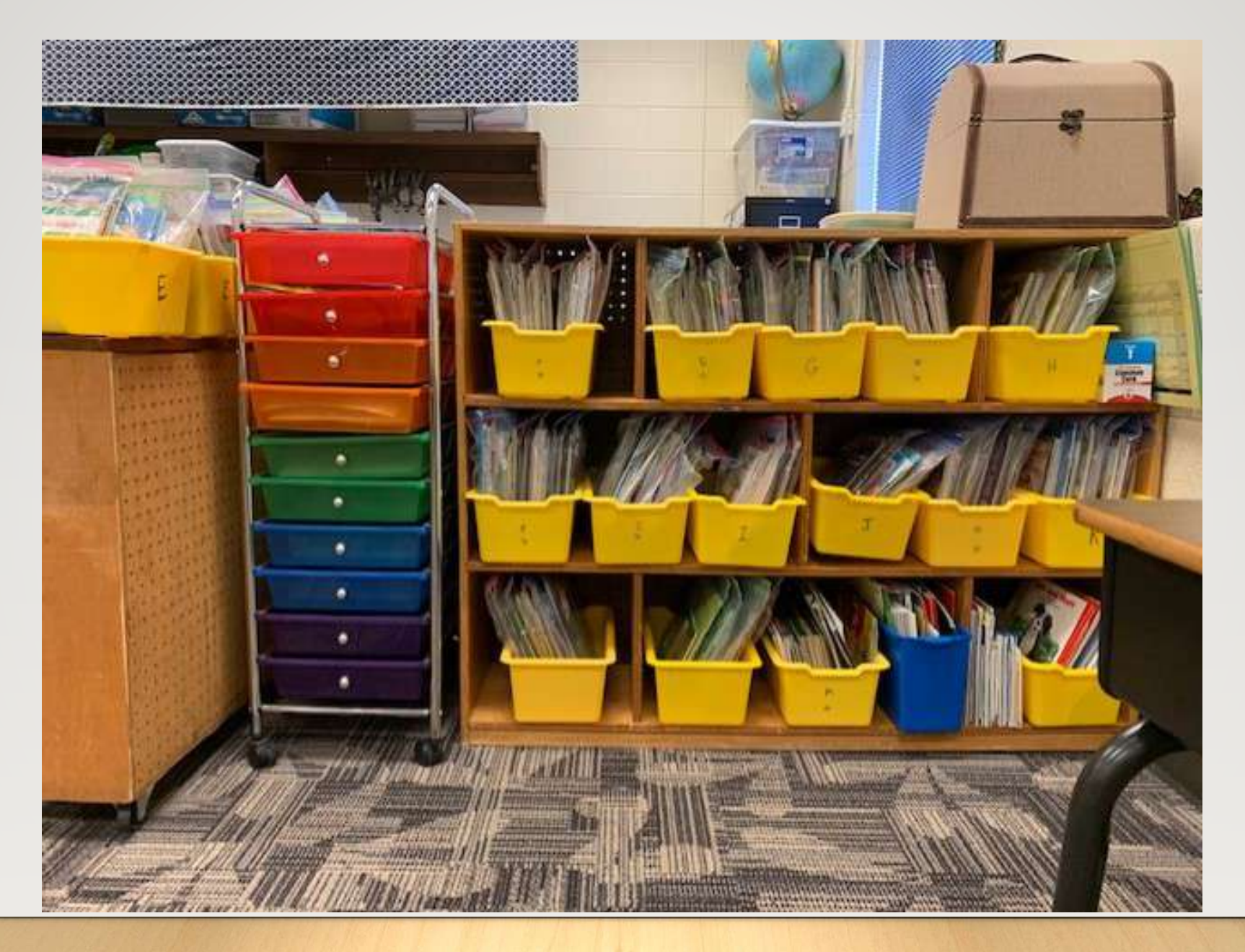
Here is our library area where you can grab a bag of books to read in your space.